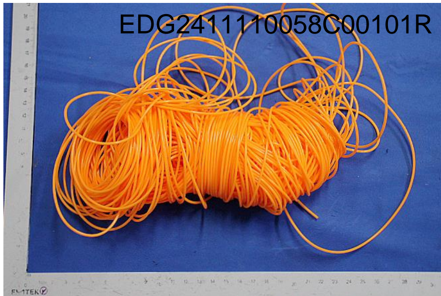
样品照片 Sample Photo

Test results are only responsible for delivered samples. This test report is issued by the company and is intended for your exclusive use. This test report includes all of the tests requested by you and the results thereof based upon the information that you provided. You have 30 days from data of issuance of this test report to notify us of any error or omission caused by our negligence. A failure to raise such issue within the prescribed time shall constitute your unqualified acceptance of the completeness of this report, the tests conducted and the correctness of the report contents.