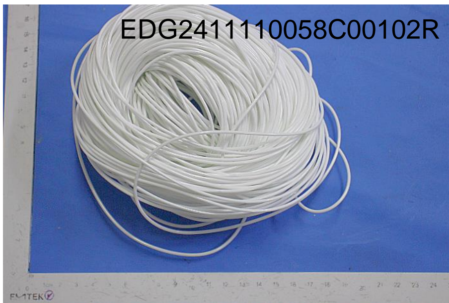
样品照片 Sample Photo

Test results are only responsible for delivered samples. This test report is issued by the company and is intended for your exclusive use. This test report includes all of the tests requested by you and the results thereof based upon the information that you provided. You have 30 days from data of issuance of this test report to notify us of any error or omission caused by our negligence. A failure to raise such issue within the prescribed time shall constitute your unqualified acceptance of the completeness of this report, the tests conducted and the correctness of the report contents.