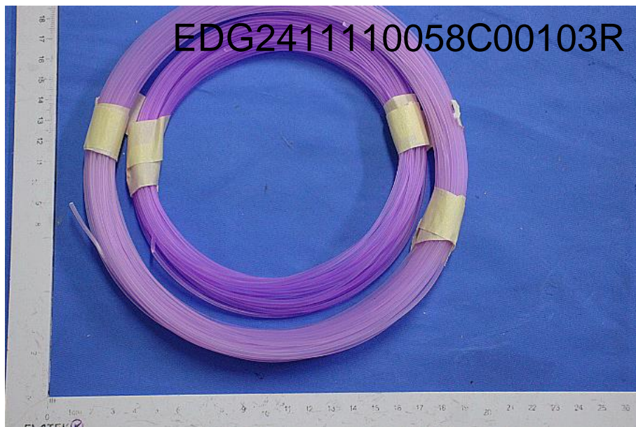
样品照片 Sample Photo

Test results are only responsible for delivered samples. This test report is issued by the company and is intended for your exclusive use. This test report includes all of the tests requested by you and the results thereof based upon the information that you provided. You have 30 days from data of issuance of this test report to notify us of any error or omission caused by our negligence. A failure to raise such issue within the prescribed time shall constitute your unqualified acceptance of the completeness of this report, the tests conducted and the correctness of the report contents.