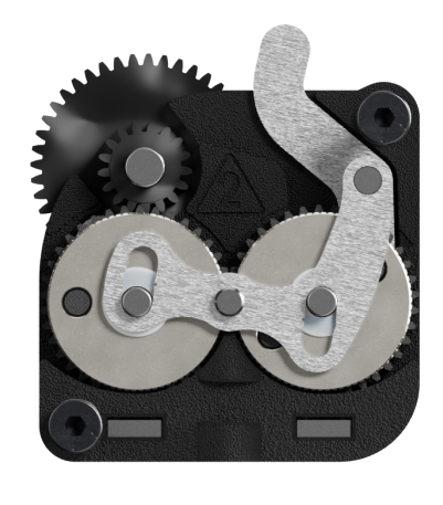
Position 0 Load or unload filament without pressure from the drivegears