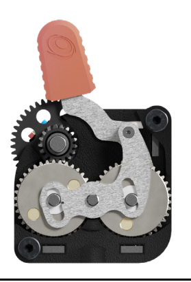
Position 1 For rigid materials.