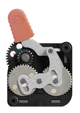
Position 0 Load or unload filament without pressure from the drivegears.

The different lever positions of the LGX Lite PRO allows for flexibility when using different kinds of filaments and for loading and unloading. Below we have outlined the intended use of these different positions.