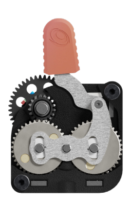
Position 2 For harder rigid materials, when you need more grip. Or for semi-flexibles >95A.