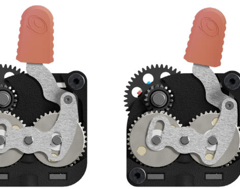
Position 3 Position 4 For flexible materials For very flexible softer than 95A. materials softer than 85A.