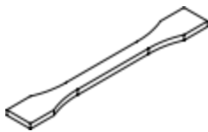
Tensile testing specimen GB/T 1040